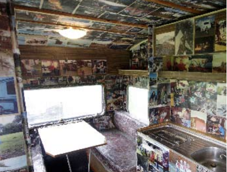
The Camping Mama , with papered camping pictures collected from peopel all over the world.