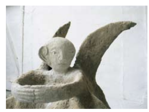
The Rolling Angels consisting of 16 angels in human size in cement, modelled over dustbin armatures