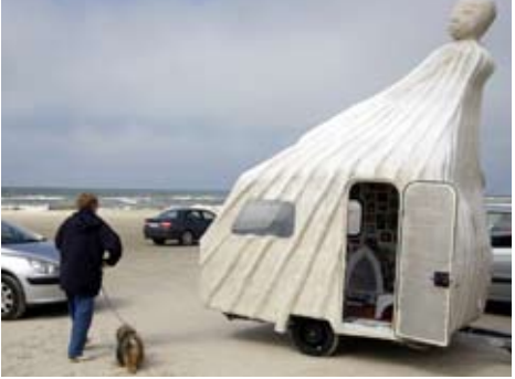
The Refugee, covered with porcelain mosaics created by 400 children.