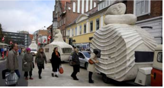
The Siren, covered with pink concrete with impressions of many hands