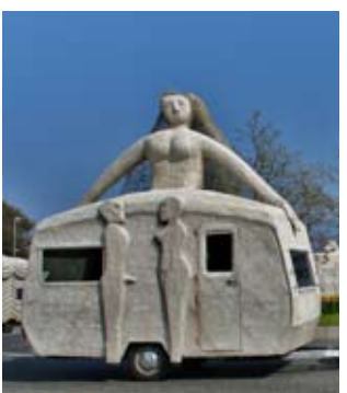
The Bride , with papered wedding pictures collected from peopel all over the world.